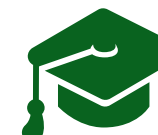
Schools and universities