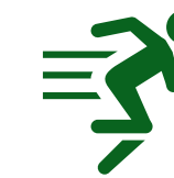
Sports and event centers