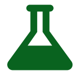
Chemical and petrochemical industry