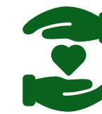
Senior citizen centers