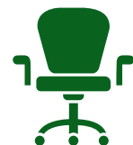
Office and administration buildings